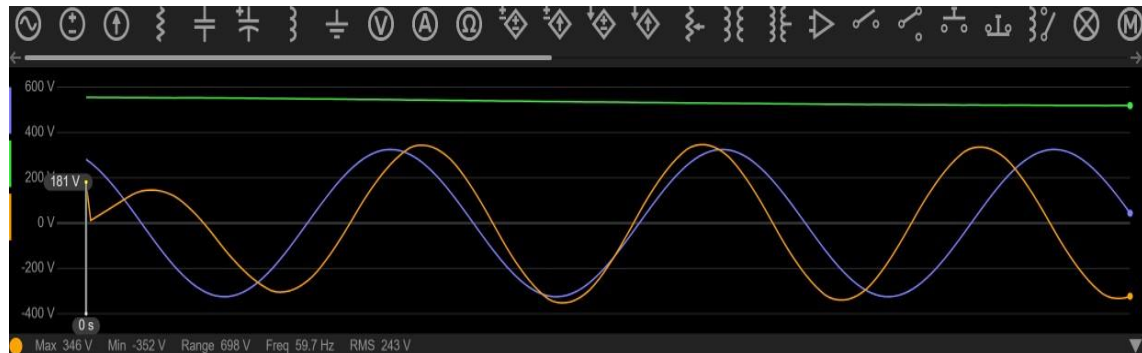
Fig: 3. Conventional AC Transmission System

technology, leading to more precise voltage management. Reactive power exchange and control are further options. HVDC lines make it easier. When examining the exchange of reactive energy, the main topics of inquiry are the power factor, the power factor control range, and reactive power losses.