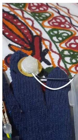
Fig. 7 : Output - 3

The piezo element used shows us the data if the patient falls or not.