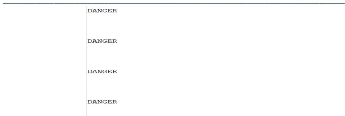
Fig. 7 : Coding part - 3