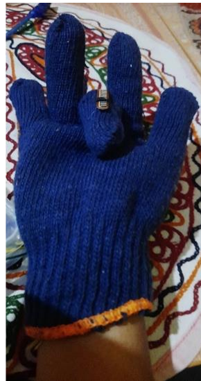
Fig. 6 : Output - 2

Upon bending the second finger we got the results which shows that the patient need to use washroom.