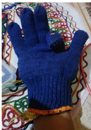
Fig. 4 : Output - 1

Upon bending the first finger we got the results which shows that the patient requires food or water