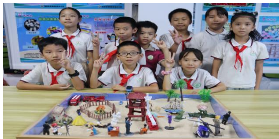
Figure 5.1: My Dreams

A question-and-answer discussion is: what is your dream? why is this your dream? what are the requirements to make this dream come true? what can you do now?