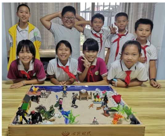
Figure 5.2: Sandplay My Strengths and Specialties

Student D said: "I took a rooster and put it in the straw shed. I think I am diligent like a rooster. I go to bed early and get up early, and I wake up my family."