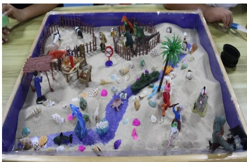
Figure 5.4: Sandplay My Time Management

A question-and-answer discussion is why is time