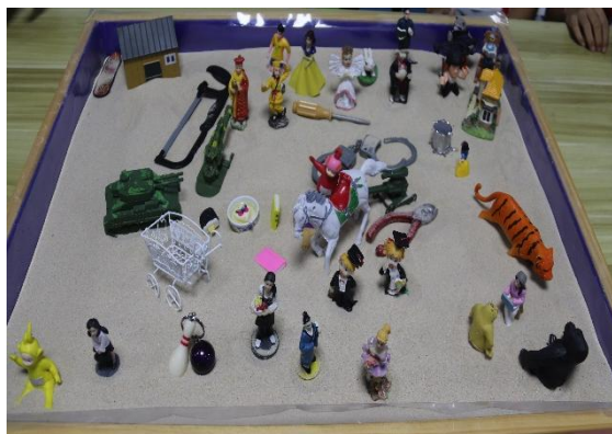
Figure 5.3: Sandplay My Temper

A question-and-answer discussion is: Why do you get upset? Give an example. When do you usually get angry? What do you do when you are upset? How do you calm yourself emotionally?