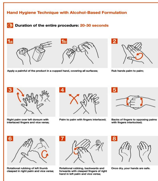
Figure (1): Hand rubbing (Spruce; 2013)

Infection control is paramount in chest drain management, as healthcare-associated infections (HAIs) are frequently transmitted through contaminated hands. Proper hand hygiene significantly reduces infection rates, healthcare costs, and hospital stays. Despite widespread awareness, studies indicate that healthcare professionals often fail to comply with recommended hand hygiene practices (Gold et al., 2022). The Centers for Disease Control and Prevention (CDC) advocates regular handwashing as a primary defense against infections. Best practices include using alcohol-based hand rubs or soap and water, scrubbing thoroughly, and drying with disposable towels. Ensuring compliance with hygiene protocols enhances patient safety and minimizes infection risks (WHO, 2009).